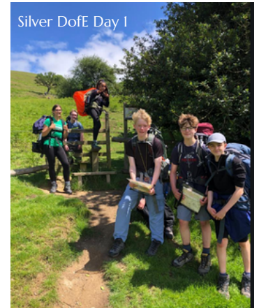
Silver DofE Day 1