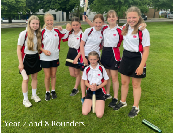
Year 7 and 8 Rounders