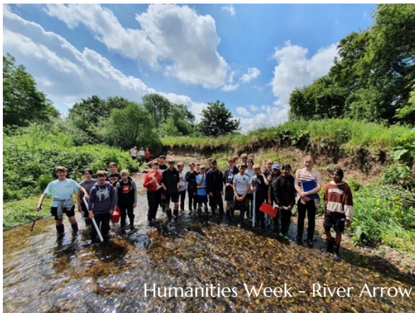
Humanities Week - River Arrow