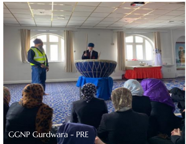
CCNP Gurdwara - PRE