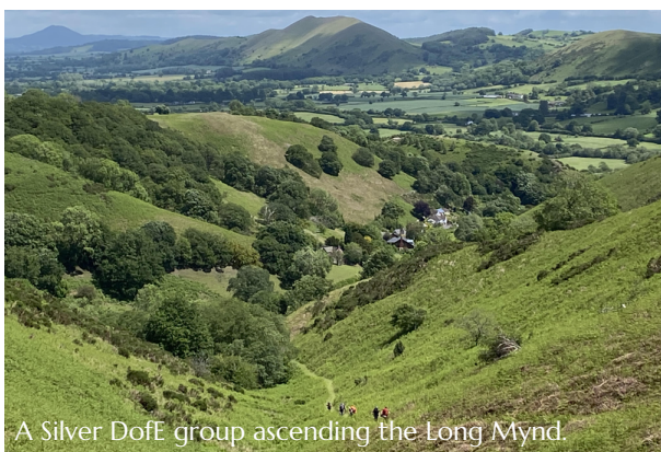
A Silver DofE group ascending the Long Mynd.