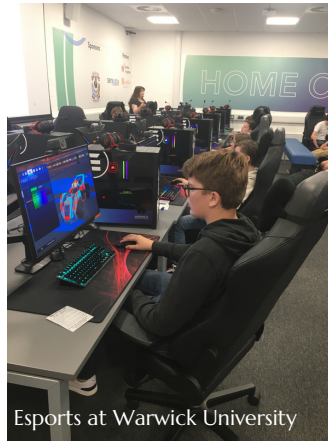
Esports at Warwick University