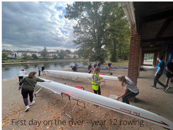
First day on the river - year 12 rowing