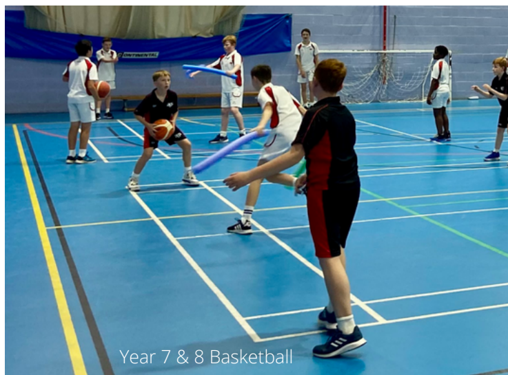
Year 7 & 8 Basketball