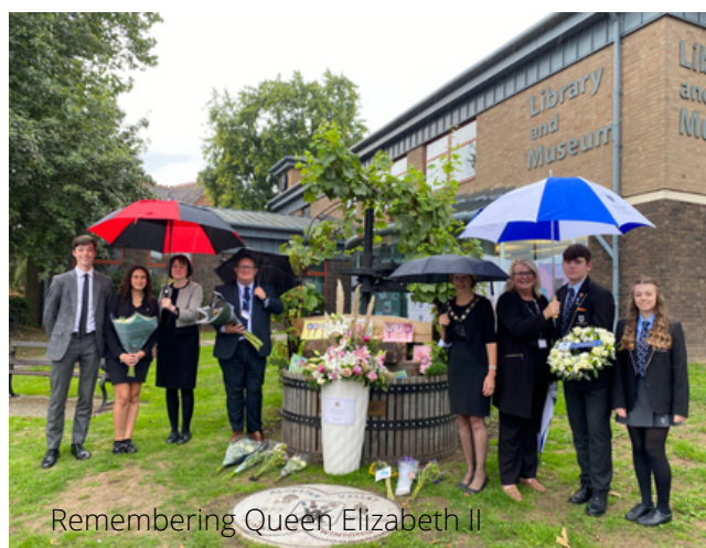
Remembering Queen Elizabeth II