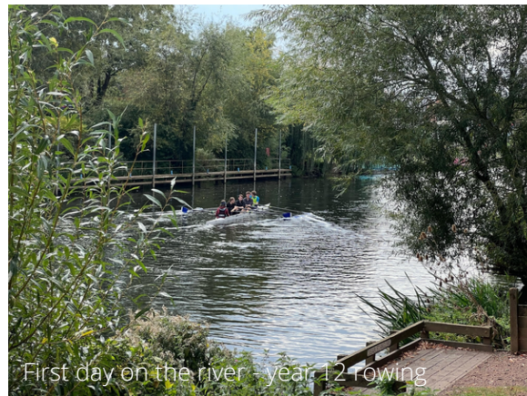
First day on the river - year 12 rowing