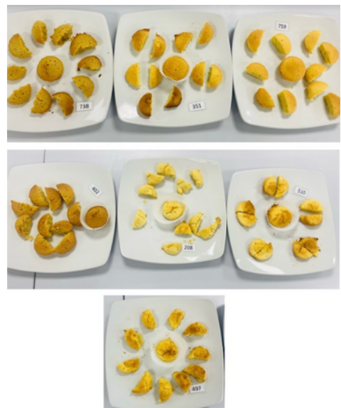
Year 10 caramelisation investigation