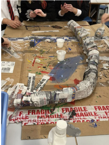
Our KS3 DT/Art club have been making a life size 'Jumanji' elephant, with some great work on the trunk this week!