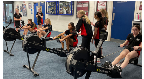
Year 7 girls have been enthusiastically contesting their Inter-House Rowing competition