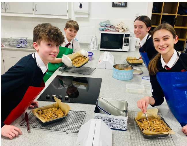
Year 8 have been looking at the importance of fibre in a healthy diet, and have made some delicious high-fibre granola bars. Hopefully some made it home for you to sample!