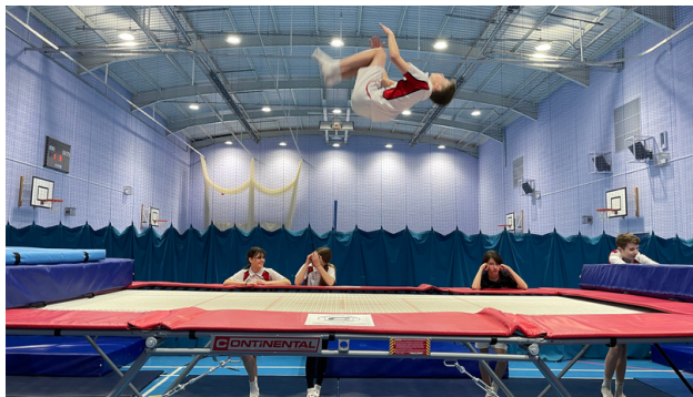
New tricks being learnt at our ever-popular Trampolining Club.